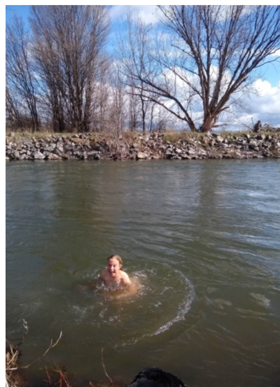
The first sighting of River Nymphs occurred last week near the CanAda Line, during Spring Break. If this keeps up, it won't be long before the Fat Lady's siren song will be heard wafting from out of the Upper Basin.